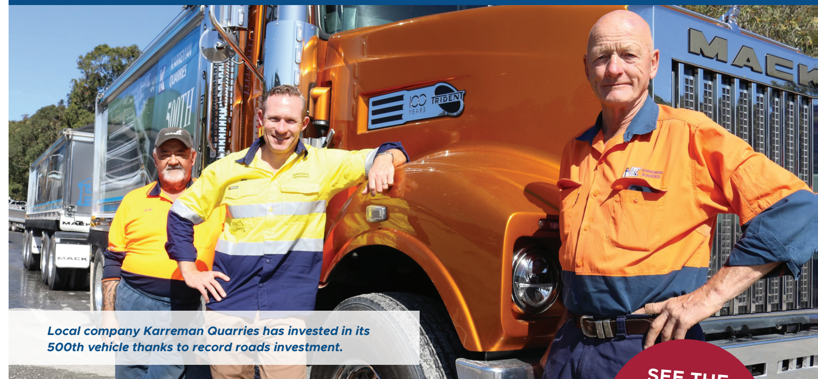
Local company Karreman Quarries has invested in its 500th vehicle thanks to record roads investment.

SPRING 2021 · SPECIAL - INFRASTRUCTURE & JOBS EDITION