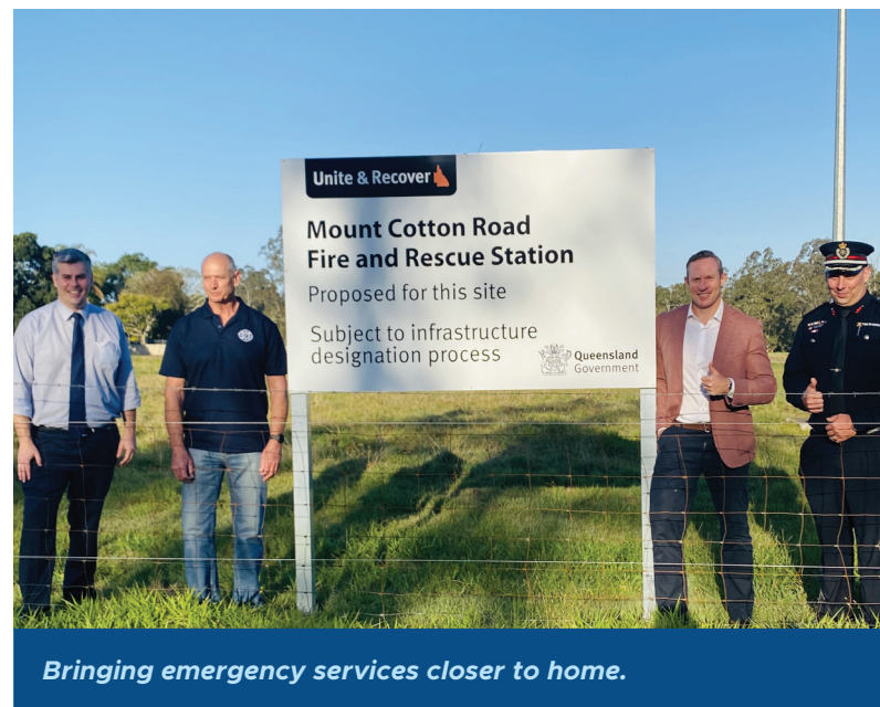
Bringing emergency services closer to home.