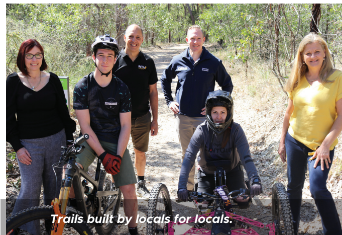
Trails built by locals for locals.