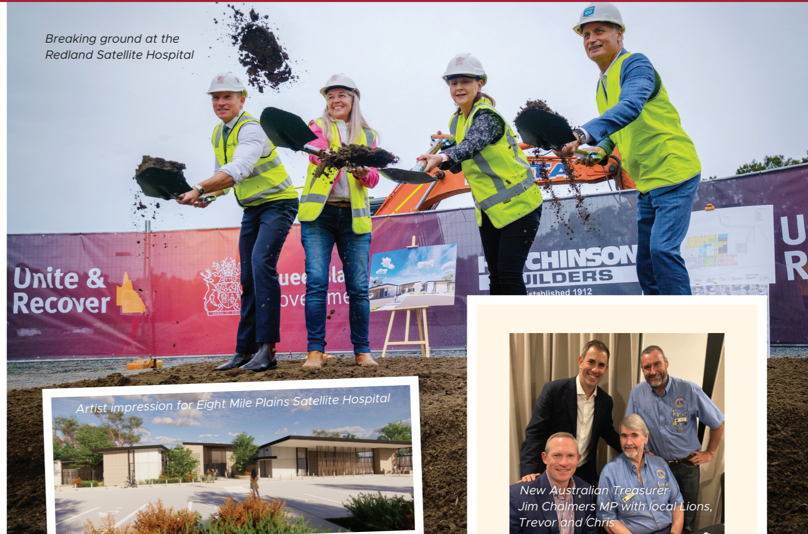
Breaking ground at the Redland Satellite Hospital