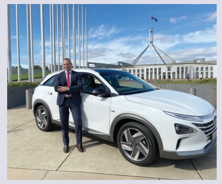
In a few months, these hydrogen-powered vehicles will hit the road as part of the Palaszczuk Government's QFleet.

If you're keen to join the conversation about hydrogen and renewables, I've set up a local facebook group. Just go here to register your interest: www.bit.ly/EnergyFBGroup