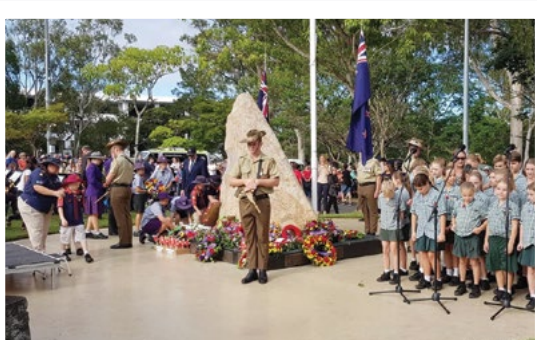
ANZAC Day is Australia's most iconic commemoration and the year 2021 will see ANZAC services return to our communities right across Queensland.