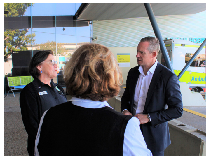
More doctors and nurses for your family - when you need them