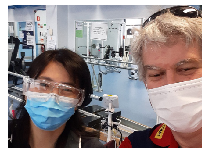
"Thev saved mv life"

"In late May, 2020 I was visiting my local GP for a medical check up when I realised my heart rate was racing. An ambulance was called and I was taken to Logan Hospital. The decision saved my life as I was in a cute atrial fibrillation.