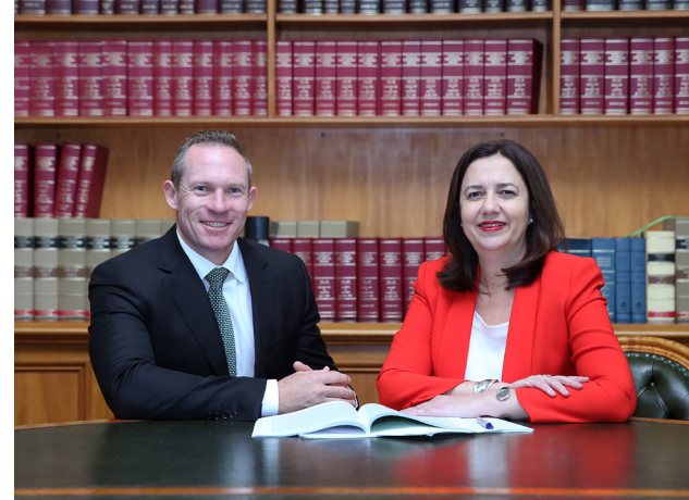
Supporting Queenslander's Mental Health

And we need to all be looking out for each other" - Premier Annastacia Palaszczuk MP