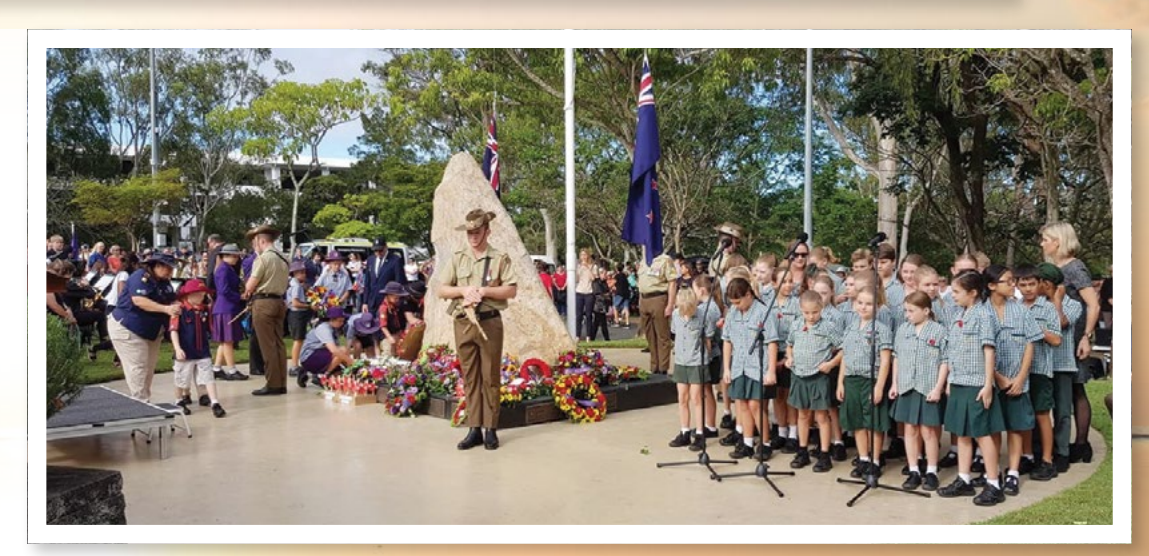
Students from Rochedale South State School at the 2019 ANZAC Day ceremony